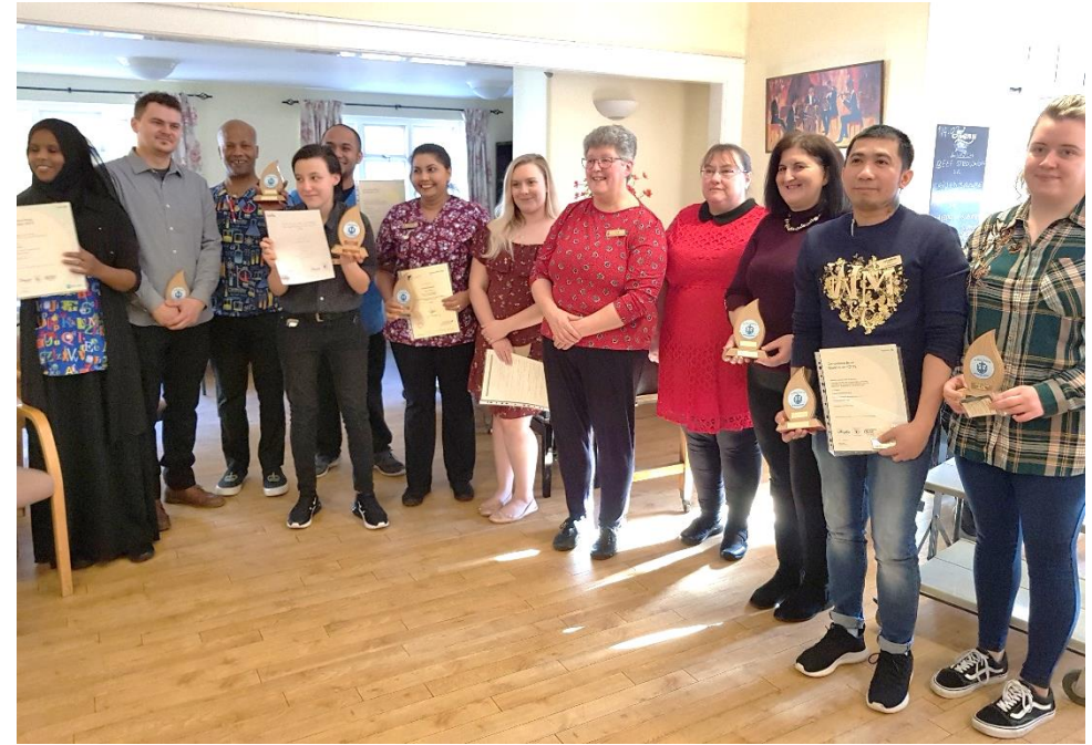
Carers QCF Awards Ceremony Level 2, 3 & 5

Everyone is welcome to join us to discuss how the Home runs. The agenda is based on items from the suggestion box and other feedback we have received.